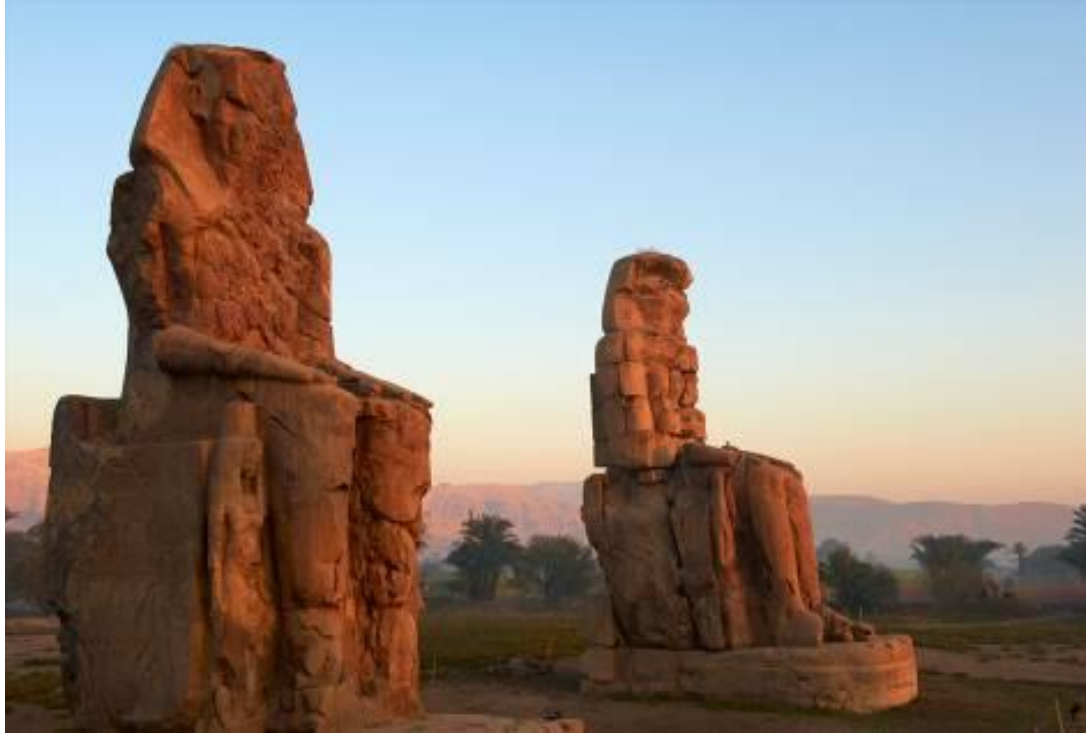
Colossi of Memnon