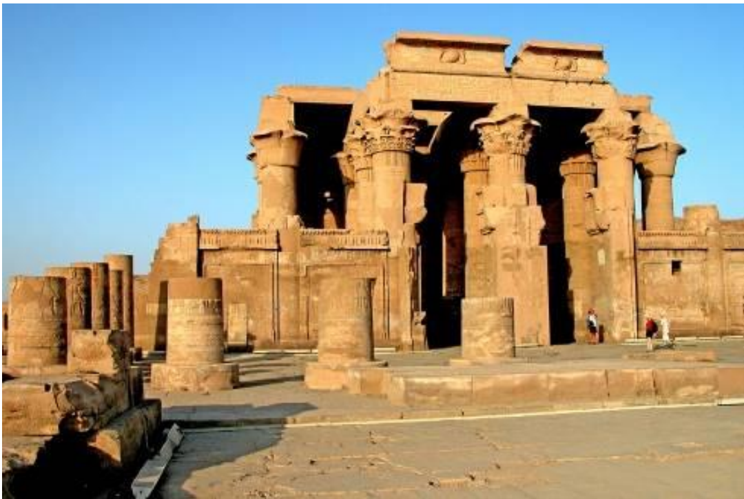
Double Temple of Kom Ombo