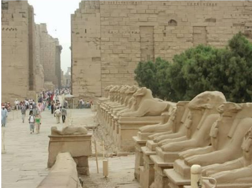
Temple of Amon-Ra in Karnak