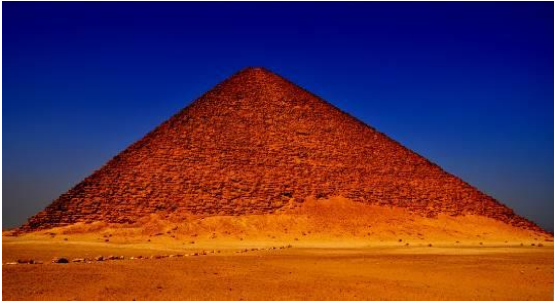
Red pyramid in Dahshur