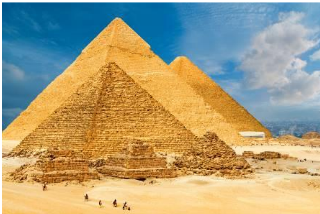
Magnificent Giza pyramids