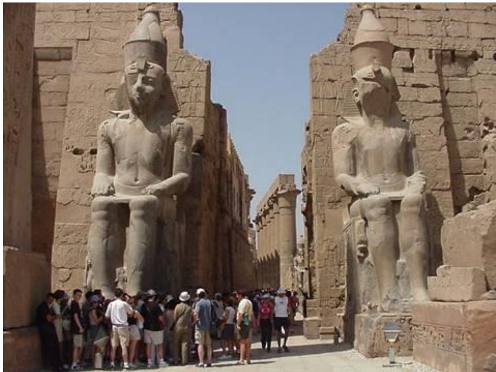
Luxor (rejuvenation) Temple