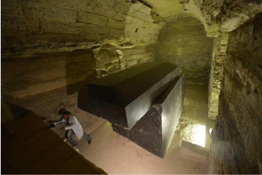
Mysterious Serapeum of Sakkara