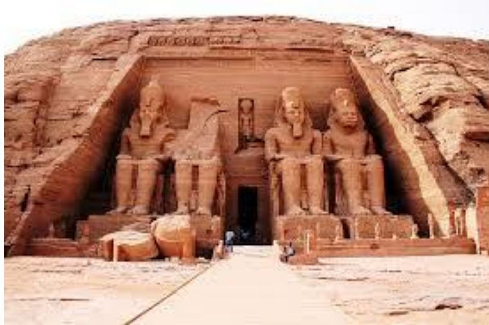
Abu Simbel temple

Breakfast in hotel, transfer to Aswan airport for departure to Abu Simbel, visit to Abu Simbel Temples (Great Temple of Ramesses II and Temple of Nefertari) , transfer to Abu Simbel airport for departure to Aswan. Meet and assist at the airport and transfer to 5-star hotel “Helnan Aswan”, overnight in Aswan.