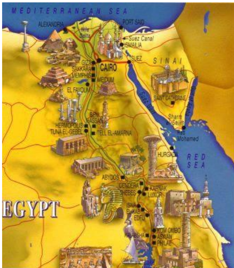
Map of Ancient Egypt